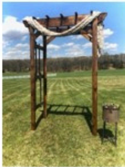
Wooden Arbor: $65.00 Dimensions: 72"W x 42" Deep x 95" H Walk through 50"