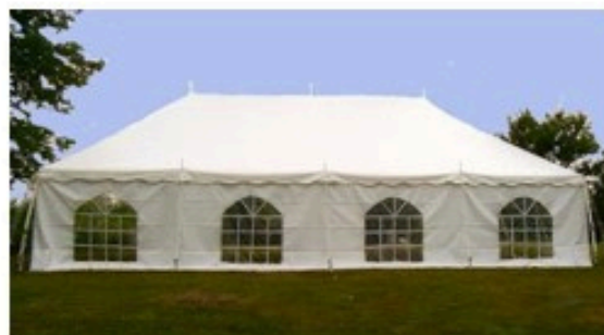
Cathedral Sidewalls: $27 per 20 ft. section Installed $33 per section