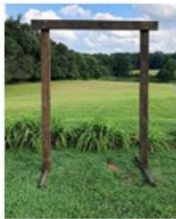
Simple Wooden Arbor: $65 Dimensions: Walk Through 72" W x 96" H (6ft x 8ft)