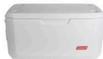
120 qt. cooler: $33 48 qt. cooler: $16