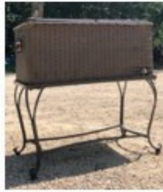
Ice Chest $30