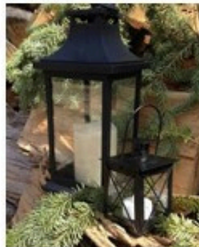
Lanterns: 12 in: $9.00 5 in: $5.00 comes with batteries 12 White large Lanterns Now Available