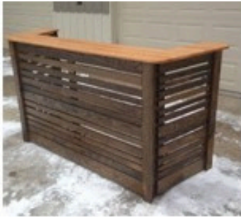
Bar: $115 Comes with shelf and Lights