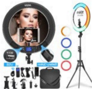
Create your own PHOTOBOOTH $35.00 Ring Light and Stand with Bluetooth Remote.