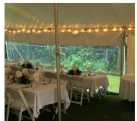
Clear Sidewalls: $27 per 20ft section Installed $33 per section