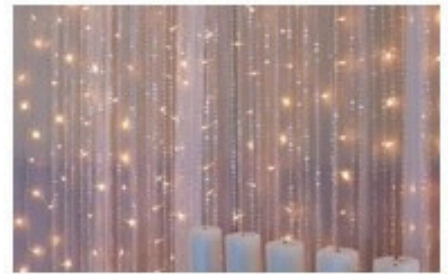
Backdrop Lighting Just lighting: $22 per 9 ft. sect. With Fabric $66 per 9ft. sect. With Drapes $82