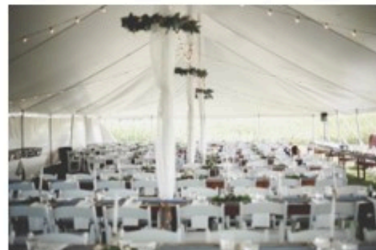
Fabric and Lighting $50 per pole