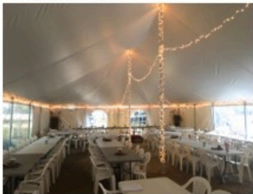
Lights on Poles: $27 per pole