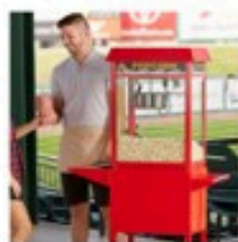
Popcorn popper $55.00 w/refundable $50 security deposit