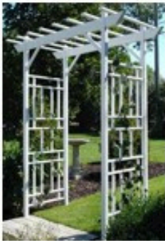
White Arbor: $65.00 Dimensions: 72"W x 42" Deep x 95" H Walk Through 50"