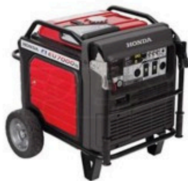
NEW: Honda Super Quiet Generator $250 for first 5 hours then $20 for each additional hour 5500-watt, Gas powered with clean inverted power