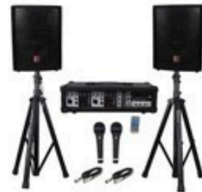
PA System: $190 setup to use Comes with 2 speakers, 1 corded microphones.