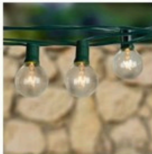
Globe Lighting: $27 per 25 ft. section