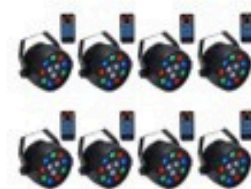
UPLIGHTING Plug in $ 16.00 each