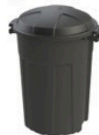
Garbage Cans $ 7.00 each comes with 2 garbage bags per can