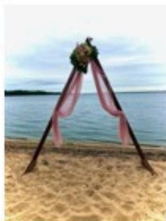
Triangle Arbor: $65.00 Dimensions: 112"H x 98" W