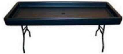
Chill Table: $33 each Keep your food and drinks cold by adding ice