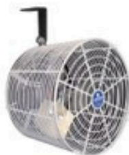
Tent Fan: $27.00 Each 12" Fan, 1.3 amps